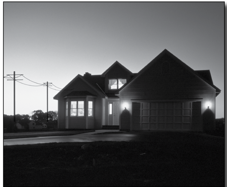
Installing motion-detecting lights outside your home can help to deter potential burglars.

For more information on any of WH Security's services, call (763) 477-3664.