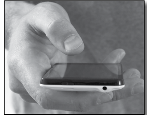
Control My Home allows you to adjust your thermostat settings from anywhere you have an Internet connection.

Control My Home offers interactive services that will give you this capability as well as the ability to remotely control many other aspects