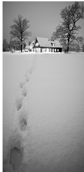
Creating visibility around an exterior's structure allows for increased visibility and will help prevent a possible intruder.

Next, ensure that all potential entry points on your property are well lit in the dark winter evenings. This includes doors and windows on all