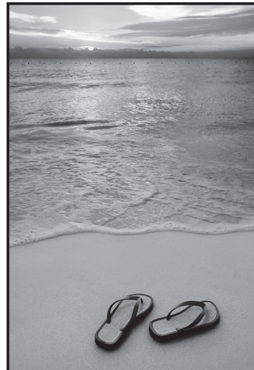
Practicing security tips will help your summer trip go smoothly.

Lastly, keep your electronic devices and valuables on you at all times. Hotel rooms are not always as secure and electronic items can easily be stolen. Similarly, never leave your luggage unattended in public areas and pay special attention to your belongings when you are in baggage claim.