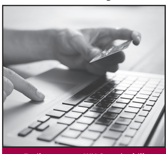
Easily pay your WH Security bill online or through the EZ Pay option.

WH Security provides various payment options, making your monthly billing as simple as possible. The following choices are available to you: