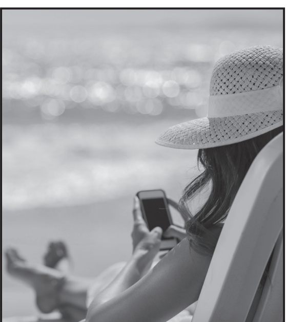
While on vacation, keep an eye on your home with WH Security's Control My Home interactive service.

To learn more about Control My Home services offered through WH Security, call a representative at (763) 477-3664.