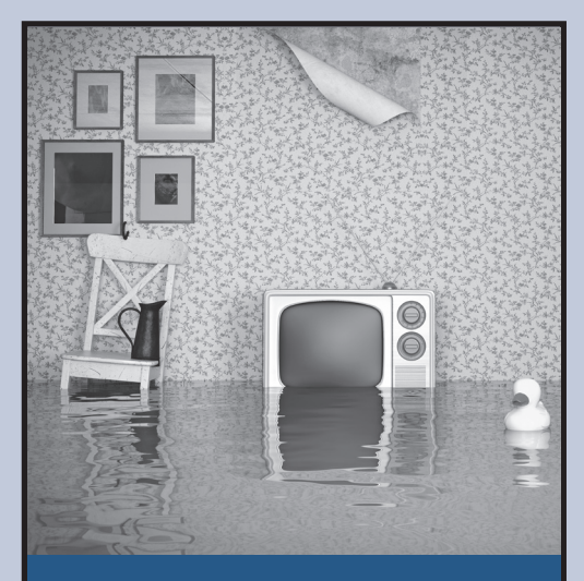
Don't let this happen to you. Protect your home with flood sensors from WH Security.

Floods can happen at any time, and you never know when your sump pump will fail until it's too late. To protect your home from water damage, contact a representative at (763) 477-3664, or visit http://goo.gl/8rdhYb.