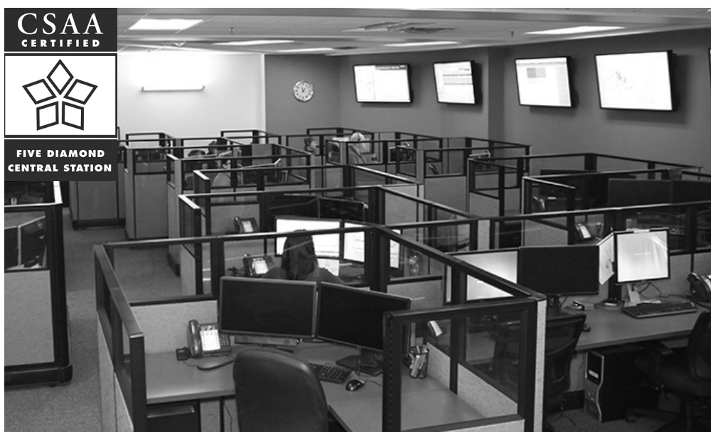
WH International Response Center is a national leader in central station monitoring.

WH Response INTERNATIONAL CENTER A wholly owned subsidiary of Wright-Hennepin Cooperative Electric Association